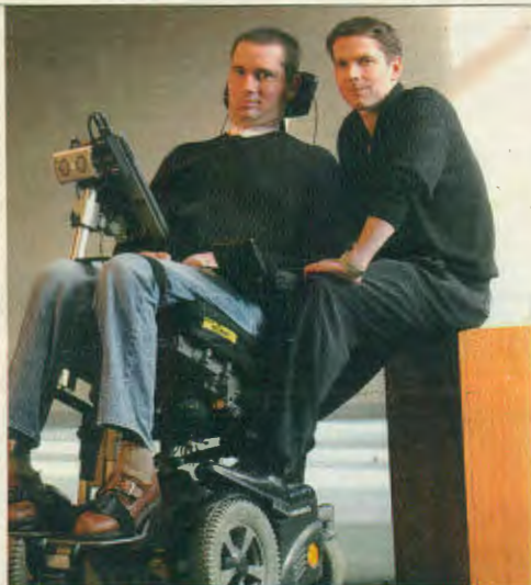
TWO BROTHERS fighting Lou Gehrig's disease.